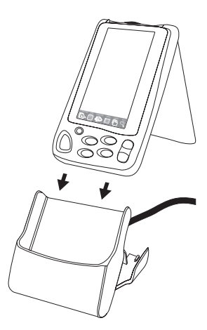
Figure 3: Docking the Avigo

Position the Avigo over the dock station and slide it gently into the dock station. Make sure the grooves on the right and left sides of Avigo engage the alignment tracks in the dock station (Figure 3).